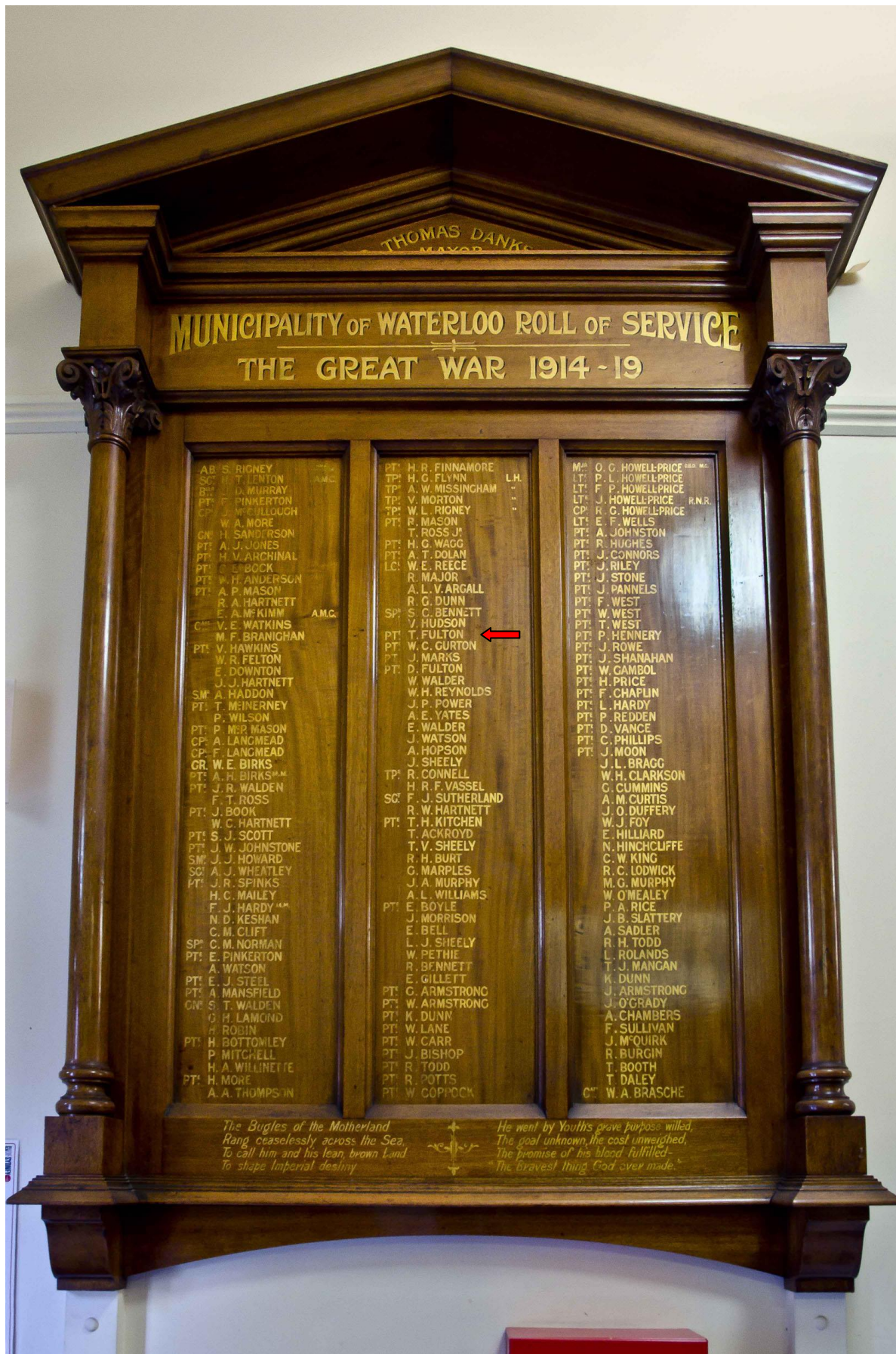
Municipality of Waterloo Roll of Service