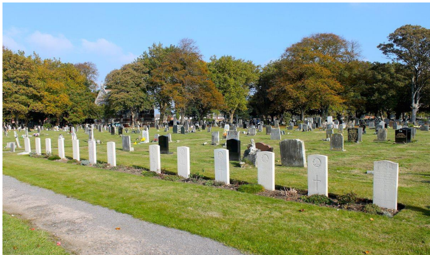
Australian War Graves in Milton Cemetery, Portsmouth